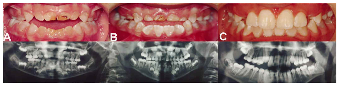
Fig. 1. Clinical and radiographical features of case 1 (A), 2 (B) and 4 (C).