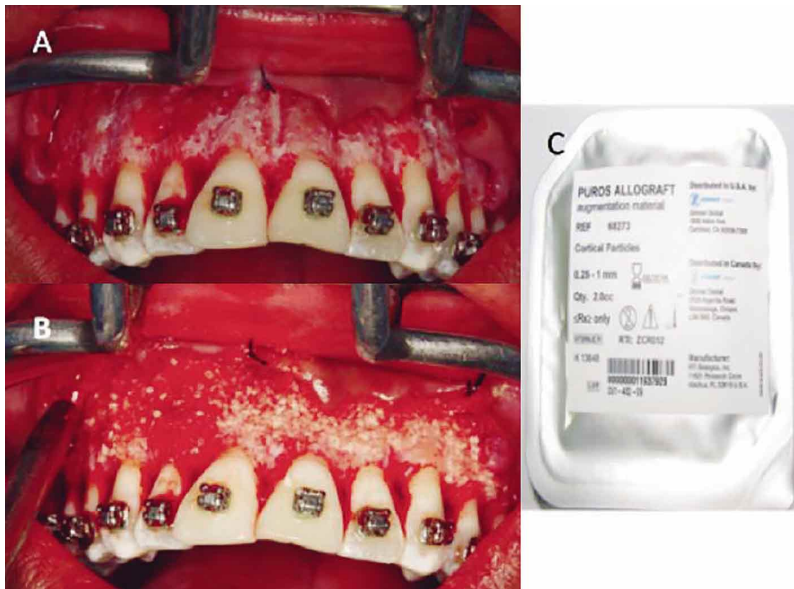
Fig. 2. Surgical procedure of the experimental group underwent Periodontally Accelerated Osteogenic Orthodontics. A) Mucoperiosteal flaps were raised in the buccal surfaces in the lower and upper teeth beyond the apical zones. B) Selective decortications were made and C) Bone Allograft (Puros™, Zimmer Dental) was placed in the areas that had undergone corticotomies.

All patients were under periodontal control during active orthodontics treatment and were Periodontally evaluated by the same individual at two different times: before surgery and orthodontic movement (T1) and after orthodontic treatment (T2). During evaluations, employing a constant pressure probe (Florida Probe Corporation) the following periodontal variables were considered: PD probing and Gingival Recession (Fig. 3).