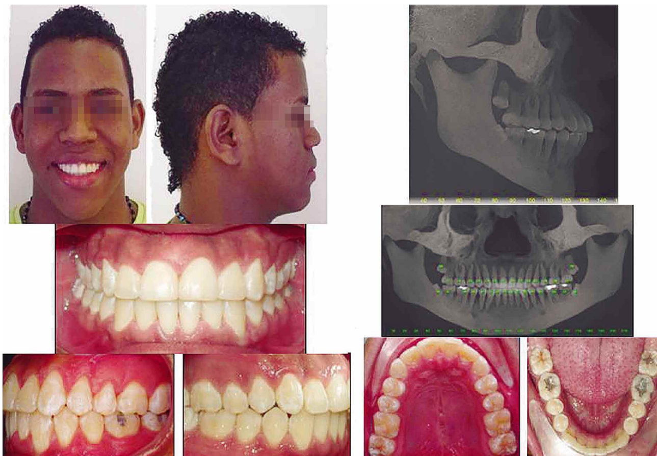
Fig. 5. The treatment outcome of the orthodontic procedure was assessed and scored with the standardized measuring gauge according to the protocol provided by the American Board of Orthodontics (ABO).

tissues on the opposite side intact, facilitating flap repositioning and suturing with the undetached oral papilla thus optimizing wound closure for primary intention. Moreover, by leaving a great volume of supracrestal soft tissues intact, better preservation of the blood supply in the interdental area may eventually occur (Binderman et al. , 2001; Nobuto et al. , 2003, 2005).