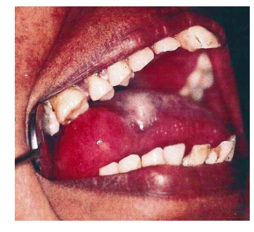
Fig. 7. Clinical photo showing swelling in the right lateral border of tongue.

Case 3. A 50-year-old male reported with a swelling on the right lateral border of tongue of 6 months duration, of size 2 X 1 cm². The swelling was soft, smooth and cystic (Fig. 7). A provisional diagnosis of dermoid/ epidermoid or sebaceous cyst was made. FNAC from the lesion showed keraninaceous material. The lesion was excised and send for histopathologic examination. Macroscopic finding consisted of soft, cystic, grayish black, 2x1x0.5 cm3 tissue. On sectioning a whitish cheesy material, probably keratin material was found. Histopathologic examination of H-E stained section showed fibrocellular cystic wall lined by thin layer of stratified epithelium (Fig. 8). A confirmatory diagnosis of Epidermoid cyst was made.