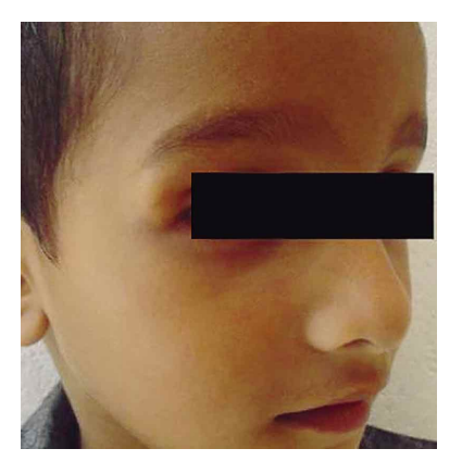
Fig. 1. Clinical photograph showing swelling around the right eyelid.