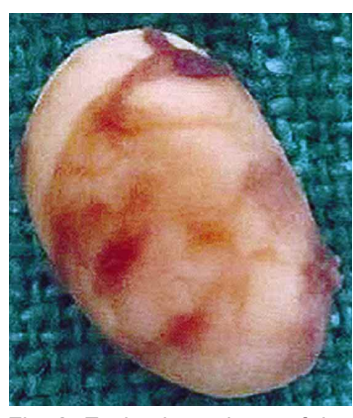
Fig. 2. Excised specimen of the lesion.