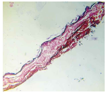
Fig. 8. H-E section showing fibrous cystic capsule and lining squamous epithelium.