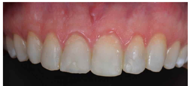
Fig. 1. Initial photos from the patient's teeth.

A 26-year-old male patient presented to São Paulo State University, in São José dos Campos. The patient reported being dissatisfied with the esthetic of his anterior teeth. After clinical examination, stained resin restorations, wear, and fractures were observed (Figs. 1-6). As a treatment plan, it was determined to perform superior esthetic restorations by the injectable technique from teeth 13 to 23 and restorations by the conventional technique with composite resin in the premolars of both Hemi-arches.