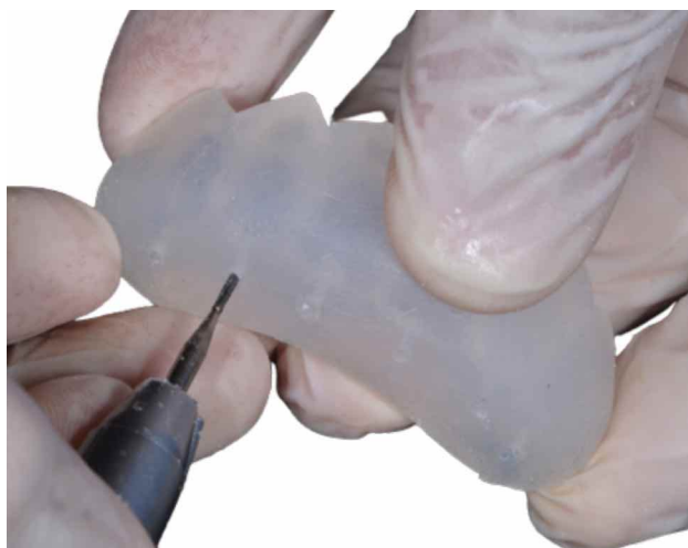
Fig. 5. Created perforations to insert the tip of the syringe of the flowable resin composite.

Previous restorations were removed with SofLex discs (3M). Prophylaxis was performed on the patient, as well as modified isolation with a rubber dam on the superior teeth. After isolation, protection with Teflon (Isotope, TVD) was made on the tooth that wasn't supposed to be restored at this moment. Enamel etching with phosphoric acid at 35 % (Ultra Etch, Ultradent) (Fig. 7) was applied, rinsed, and dried. For the adhesion system, Single Bond Universal (3M) was