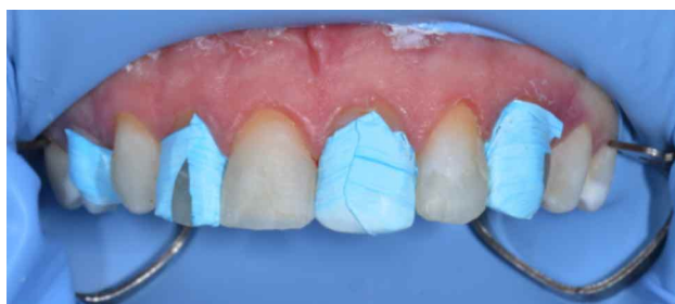
Fig. 6. Isolation of the teeth to be restored and separation of the other teeth with a Teflon band.

used, and it was photopolymerized for 20 seconds (Emmiter A Fit – Schuster). The index was positioned in the mouth and a flowable injectable resin syringe was inserted into the incisal perforations created on the index (Fig. 8). After the injection of the flowable resin (G-aerial Universal Flo BW, GC Corporation) on each tooth, photopolymerization was realized on the labial and lingual faces for 30 seconds on each.