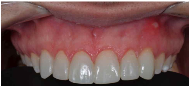
Fig. 9. Final photos of the patient's teeth after finishing and polishing.