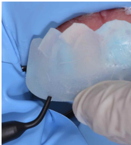
Fig. 8. Silicone index and the tip of the flowable resin positioned on the incisal's perforations.