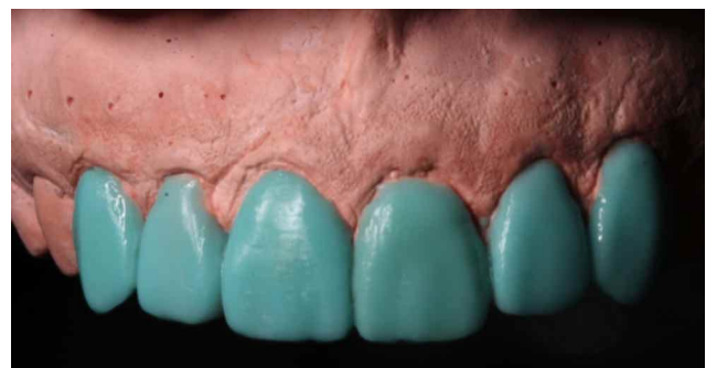
Fig. 2. Wax-up performed for producing the transparent index for the restorations.