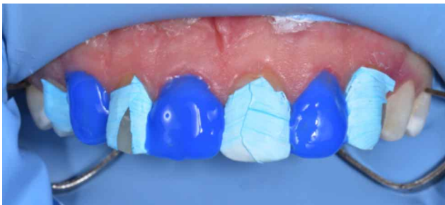
Fig. 7. Phosphoric acid etching.

After a week, the patient returned for a follow-up appointment. There could be observed some staining in the cervical area, near the gingival margin. A new finishing and polishing procedure was executed with the same materials described before. Regions that presented a lack of material were sealed with the flowable resin. These procedures were performed to improve the restoration's esthetic and longevity.