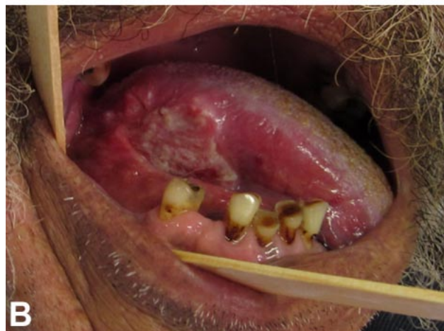
Fig. 1. Clinical evidence of lower lip squamous cell carcinoma (A) and oral tongue squamous cell carcinoma (B).

Lip SCC cases (Fig. 1A) corresponded to 27.4 % (n = 34) of the total cases, with the lower lip being the most affected in 97 % (n = 33) (Table I), mostly in males (64.7 %) (Fig. 2A). The fifth and sixth decades