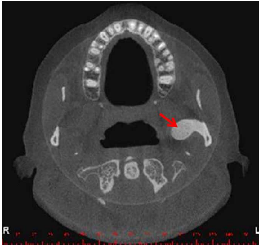
Fig. 3. Axial CBCT scan showing radiodense image in the medial surface of the left ramus of mandible (arrow).

ramus of mandible, right below the mandibular notch compatible with the osteoma (Figs. 2 and 3). The tri-dimensional reconstruction was also accomplished (Figs. 4 and 5).