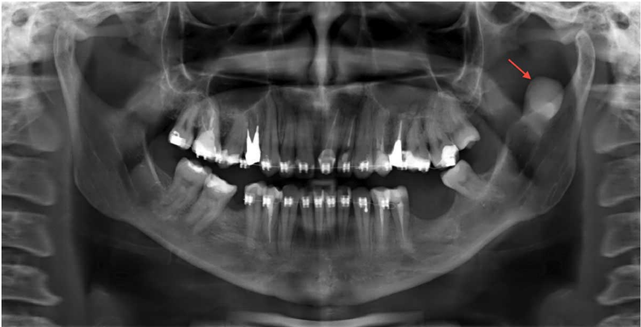
Fig. 1. Panoramic radiography showing a radiopaque image in the left ramus of mandible (arrow).

A panoramic radiography in which we noticed a radiopaque image in the left side of the ramus of mandible was carried out (Fig. 1). Posteriorly a CBCT was carried out, in which we could notice a radiodense, cylindrical, pediculated image, with well defined borders, in the medial surface on the left side of the